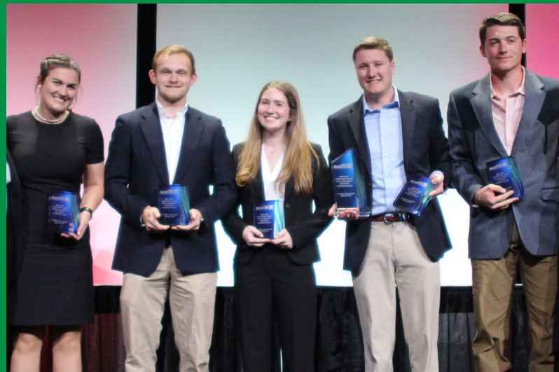
1st Place: Clemson University