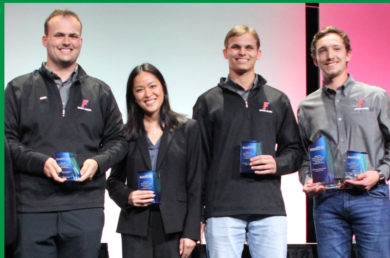
2nd Place: University of Florida