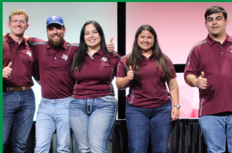
3rd Place: Texas A&M University